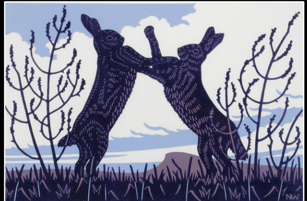
Bob and Weave

89 artists and 400 images of a 'host of hares'